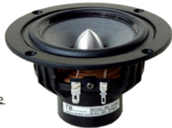
4" PAPER FULL RANGE