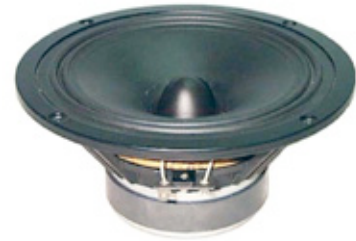
6.5" PAPER WOOFER